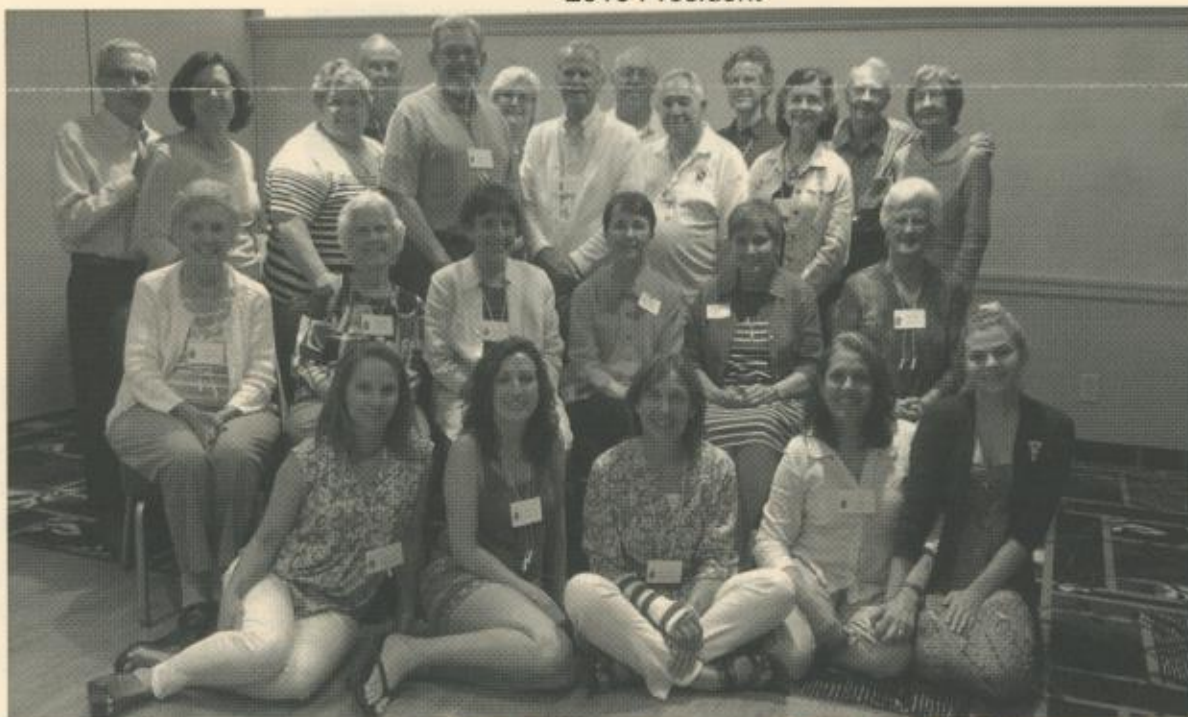
Members present at the 2016 Annual Reunion of the Fulgham-Fulghum Family.