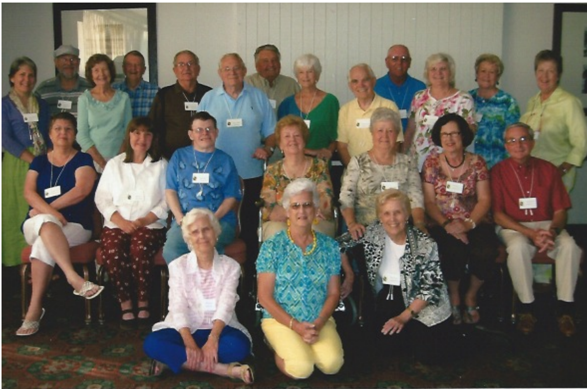
Reunion attendees, pictured left to right: