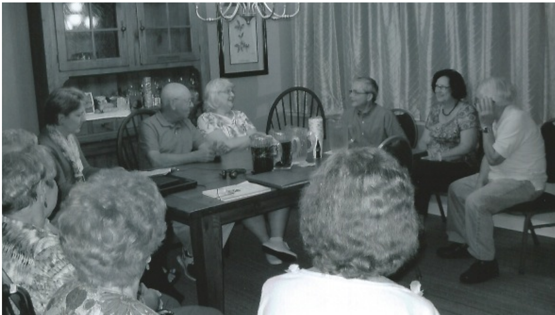
A Working group