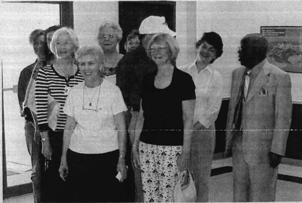
The last group to depart have their picture taken at the door