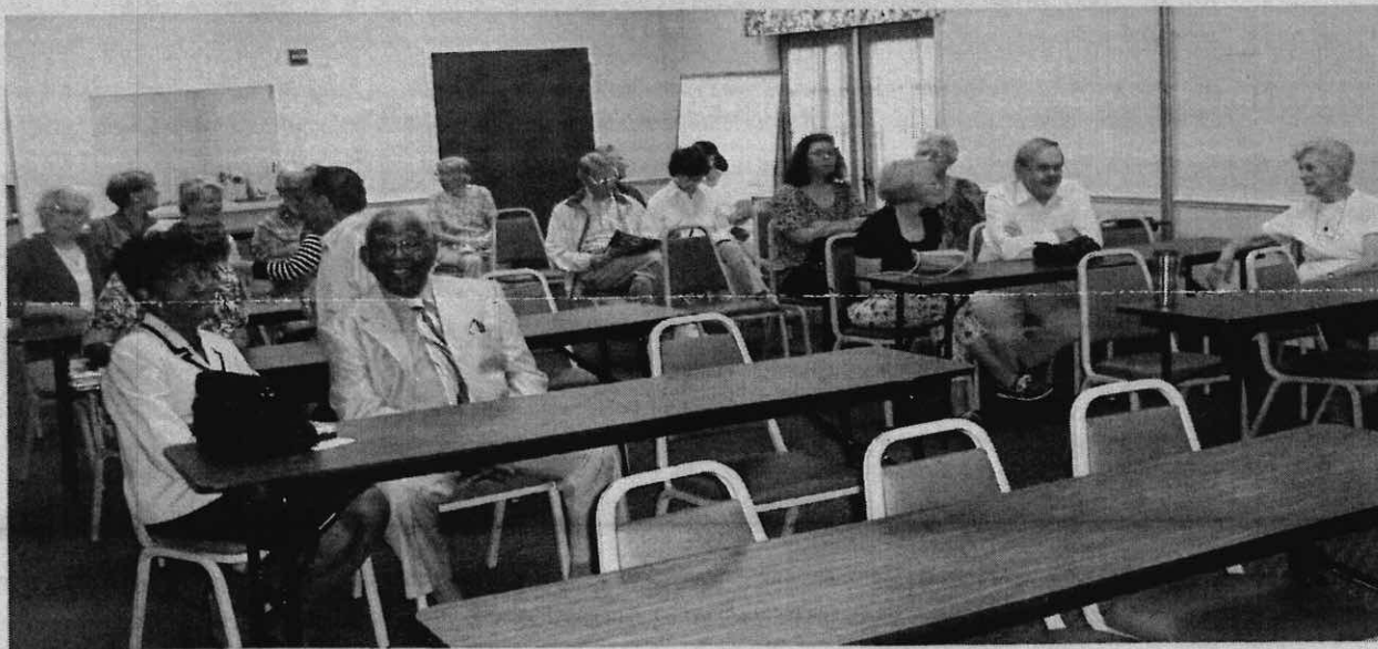
Gathering for the Sunday meetings, the first arrivals wait for the remainder of the attendees and for the meeting to start (Like Church, all of the early arrivals sit in the back of the meeting room)