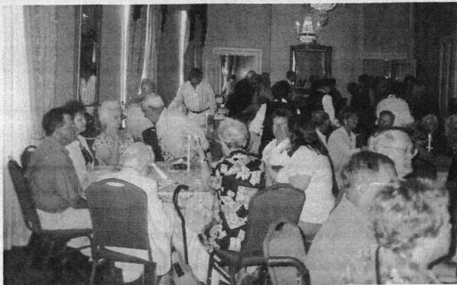
Attendees at the FFFNA Dinner and President's reception.

More pictures on Page 9 showing other scenes at the Friday night Dinner (next three pictures top to bottom). Fourth picture down was taken during the Sunday morning Annual Business meeting of the FFFNA, Pictures at the right side taken at the Saturday night dinner at the Marina