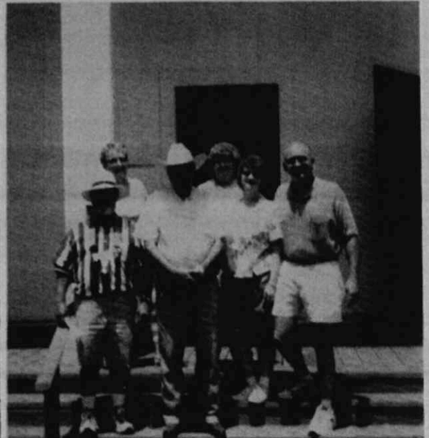
On the front steps of the Old Richland Church