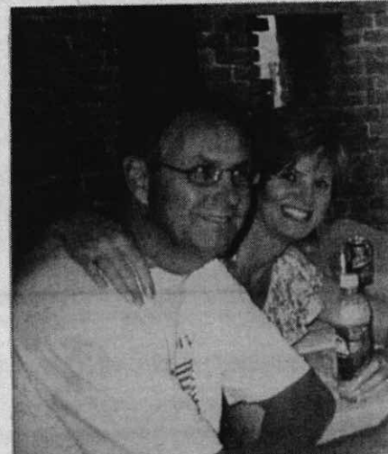
2004 Reunion attendees at old Fort Jackson. Following the tours of the Fort, a Low Country boil dinner was served at the Fort. This was followed by the soldiers firing one of the old cannons at the Fort.