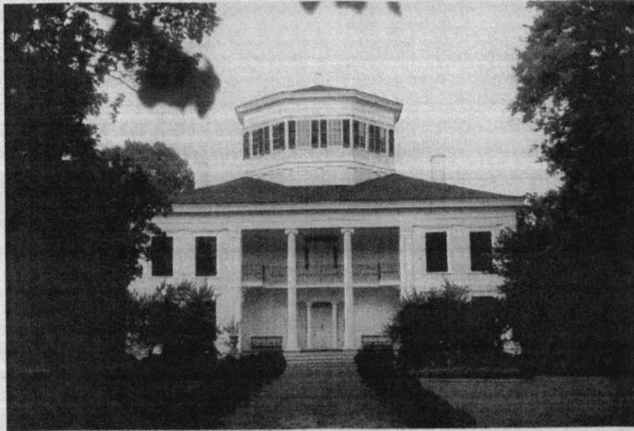
Figure 3. Waverly Mansion, West Point, Mississippi. Completed in 1852.