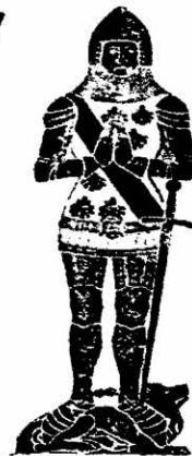
John Foljambe, c. 1358 Cathedral of the Peak, Tideswell

This family tour to England will put you in touch, LITERALLY, with our family's rich heritage. Not only many family ancestral sites, but also some of England's most enchanting scenic areas.